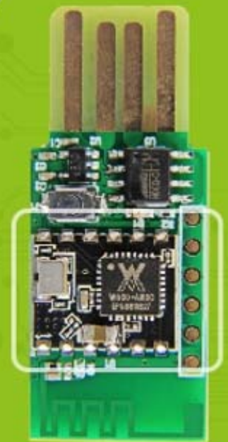
Air602 WiFi Development Board